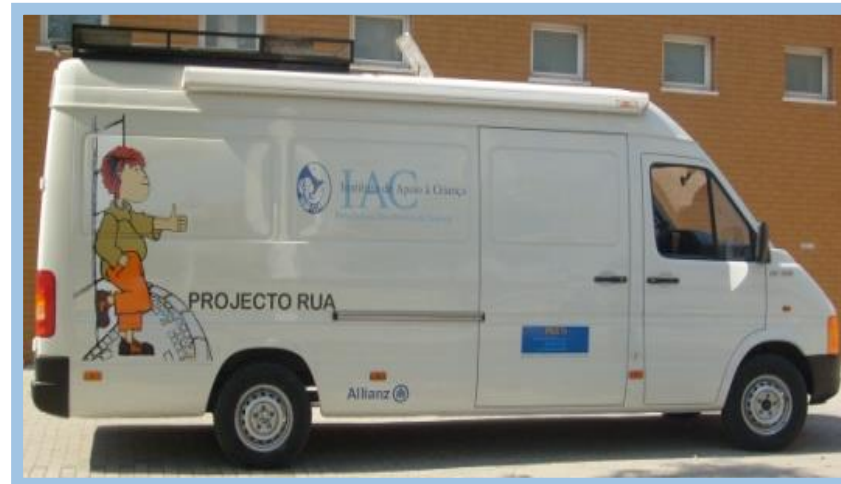
Intervention support van (Street Kids Project)