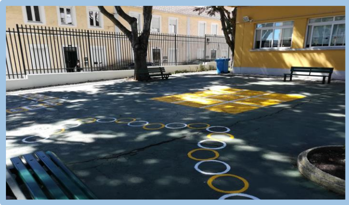
“Escolas de (e a) Brincar” / Project (Play Activity)