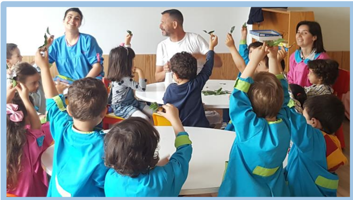
Activities developed with children in school (Coimbra Center)